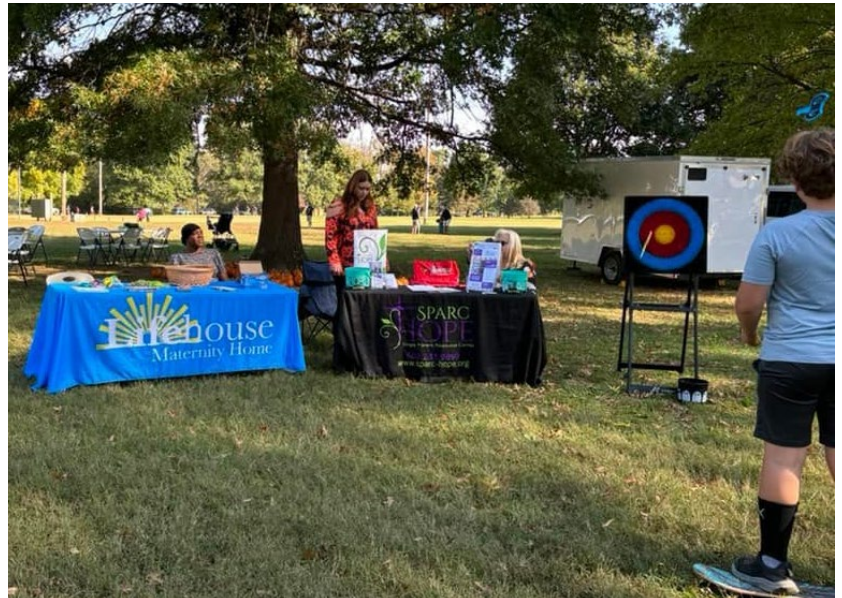
Sharing about Lifehouse at Compass Christian Church Fall Fest.

"Love is patient, love is kind. It does not envy, it does not boast, it is not proud."